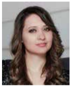
By Hermoine Macura-Noble Special to The Times Kuwait

Self-love encourages a healthy relationship with food and fitness—moving away from restrictive diets and harmful workout trends. Instead, it fosters a mindset that values holistic well-being, where nourishing the body becomes a form of self-respect rather than a means of achieving unattainable beauty standards.