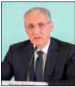
Mukhtar Babayev President-Designate of COP29, is Minister of Ecology and Natural Resources of Azerbaijan.

Our world is at a critical juncture. The devastating effects of global warming are increasingly evident, and the crisis is deepening. To mitigate it, we must urgently reduce global greenhouse-gas emissions. Failing to act now will only increase the human and economic toll.