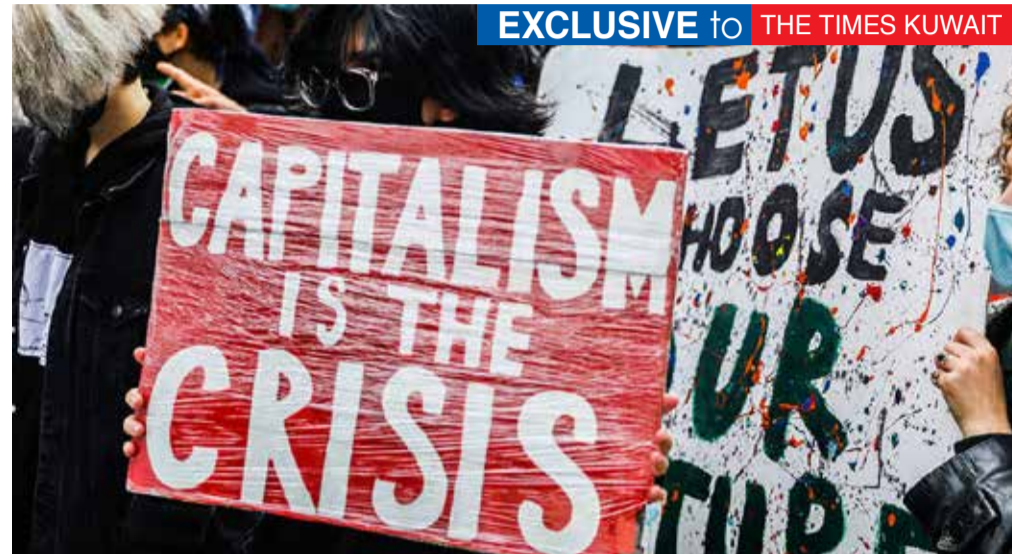
EXCLUSIVE TO THE TIMES KUWAIT

It is not the first time that capitalism has upended democracy. A century ago, the effects of rapid industrialization at the expense of individuals and their communities fueled communism and fascism in Europe. Writing during World War II, the economic historian Karl Polanyi traced the root cause of his era's