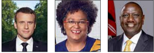
Emmanuel Macron, Mia Amor Mottley, and William Ruto