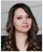
By Hermoine Macura-Noble Special to The Times Kuwait

Social media often creates a distorted reality, where kids constantly compare themselves to idealized images and lives. This endless comparison can lead to feelings of inadequacy, isolation, and low self-worth, which are all significant contributors to depression.