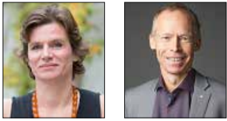
Mariana Mazzucato and Johan Rockström

Mariana Mazzucato, Founding Director of the UCL Institute for Innovation and Public Purpose, is Co-Chair of the Global Commission on the Economics of Water and Co-Chair of the Group of Experts to the G20 Taskforce for a Global Mobilization Against Climate Change.