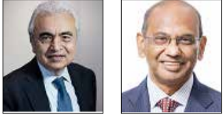
Fatih Birol and Ajay Mathur

Fatih Birol is Executive Director of the International Energy Agency.