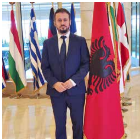
H.E. ILIR HYSA Ambassador of Albania, Kuwait

Albania's investment landscape also offers opportunities in agriculture, real estate, tourism, energy, and manufacturing.