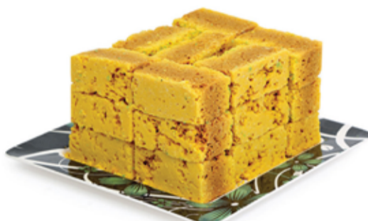
₹ 2.690 Mysore Pak /kg