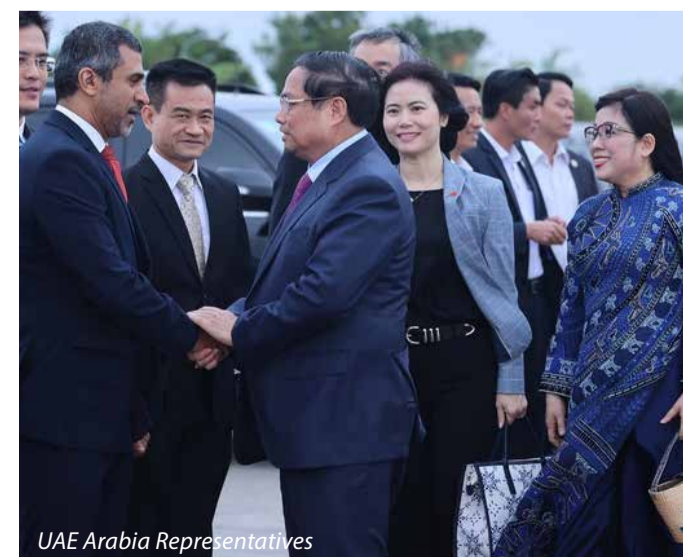
UAE Arabia Representatives