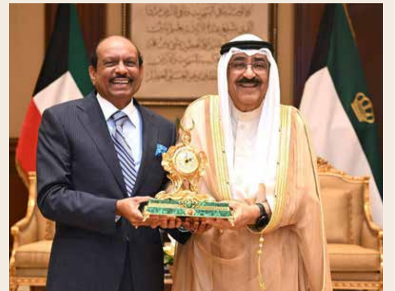
Yusuff Ali MA, CMD of LuLu Group International extends greetings to His Highness the Amir of Kuwait Sheikh Meshal Al-Ahmad Al-Jaber Al-Sabah, at Bayan Palace in Kuwait.