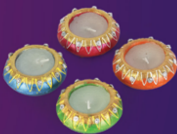
₹ 1.500 Fair Matki With Wax SDW24-118

UPTO 70% OFF Diwali Decorations Selected Items