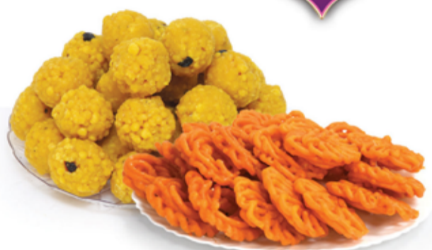
₹ 2.890 South Indian Laddu / Imarti /kg