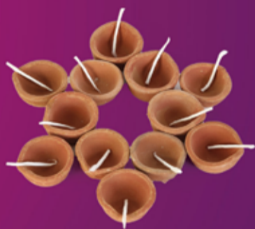
₹ 0.700 Fair Diya With Wick 12 Pcs