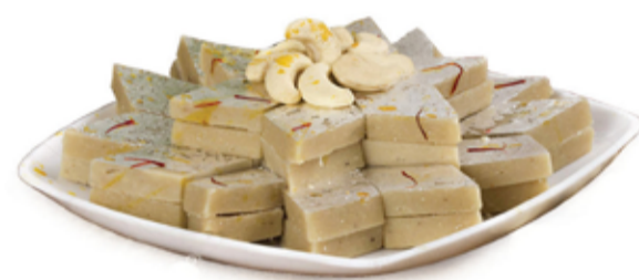
₹ 4.690 Kaju Katli /kg