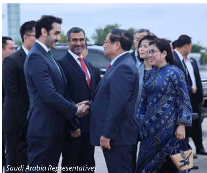
Saudi Arabia Representatives

active international integration. Priority in these policies is given to diversifying markets, partners, and supply chains as a way of continuing to consolidate the peaceful and cooperative environment, and maximizing the attraction of resources for national development.