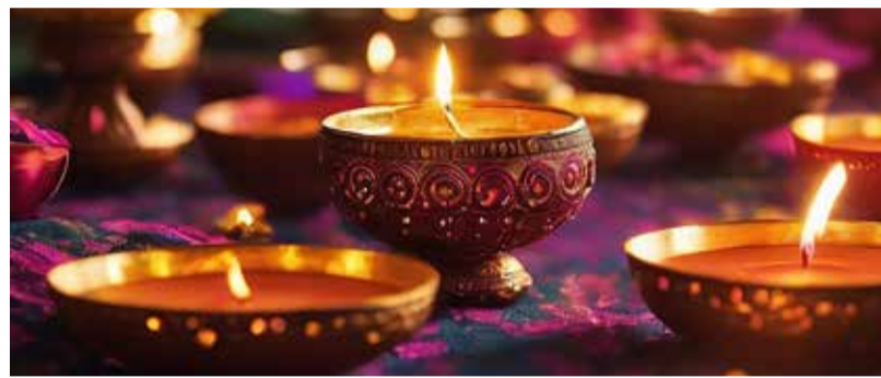
vast subcontinent Diwali remains symbolic of the inner light that guides us throughout our lives. The festival resonates with the message of the

Beyond its religious, cultural, and historical significance, and despite the contextual differences in its celebration, to people across the