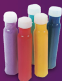
₹ 0.650 Fair Rangoli 5-Colors