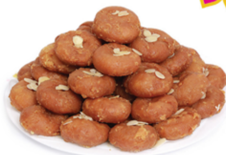
₹ 2.490 Balushahi /kg