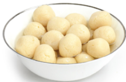
₹ 0.150 Rasagulla /pc