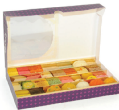
₹ 3.990 Mixed Indian Sweets /kg