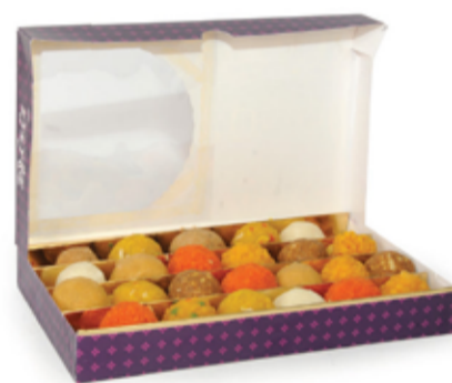
₹ 2.790 Mix Laddu /kg