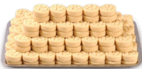
₹ 3.690 Peda /kg