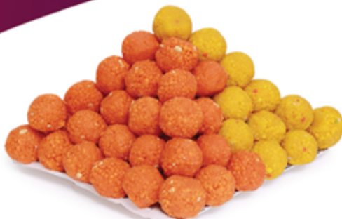
₹ 2.890 Motichoor Laddu (Yellow/Red) /kg